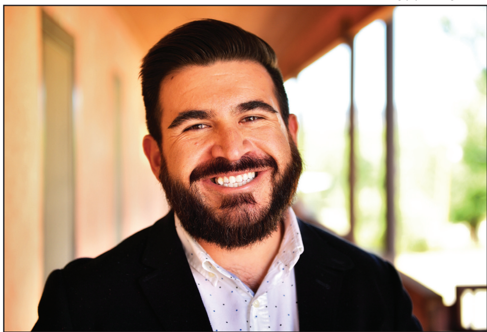
"Number one is to travel. My ultimate goal is to retire in Barcelona surrounded by art, architecture and music. Everyone wants to sky dive, thrill seeking, but I'm more about expanding my cultural horizons, visiting the Louvre and seeing in person all the works created by the masters."