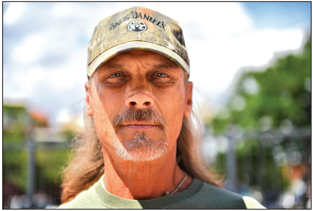
"Wrestling and football. I was small, and a wide receiver on the football team. We were all-district. In wrestling, I was super flyweight. I went 23-2.'