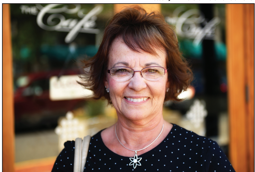
"My first job was at Koch's Drug Store in Milwaukee when I was 17. I was a part-time clerk there for four years. The pay wasn't much, $1.26 an hour, but it was one door away from my house."