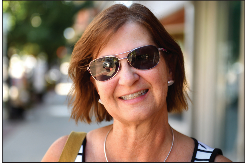
"There are too many wonderful organizations in this community to name just one. There are lots of good people doing lots of good things."