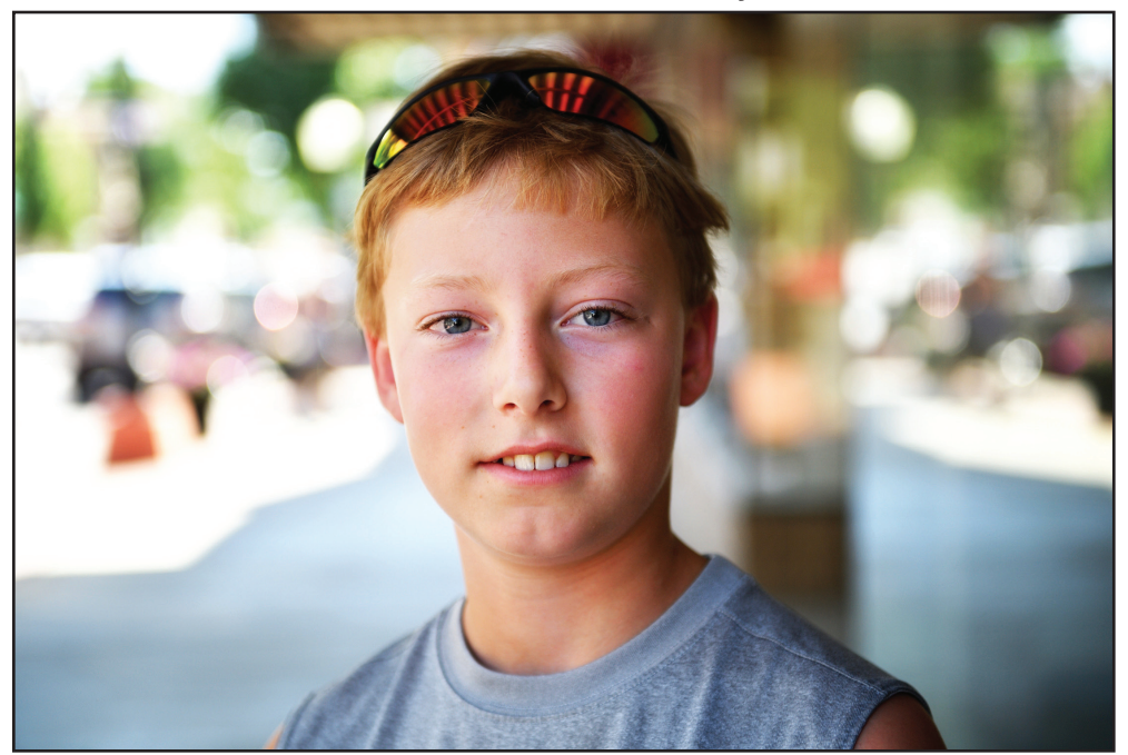
"Hmm, let's see. Chocolate Chip Cookie Dough at Baskin-Robbins. I get it whenever they have it. We go about once a week."