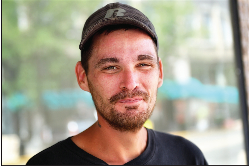
"Neapolitan, because it has all three flavors—strawberry, vanilla and chocolate. That's been my favorite all my life. I like Blue Bunny."