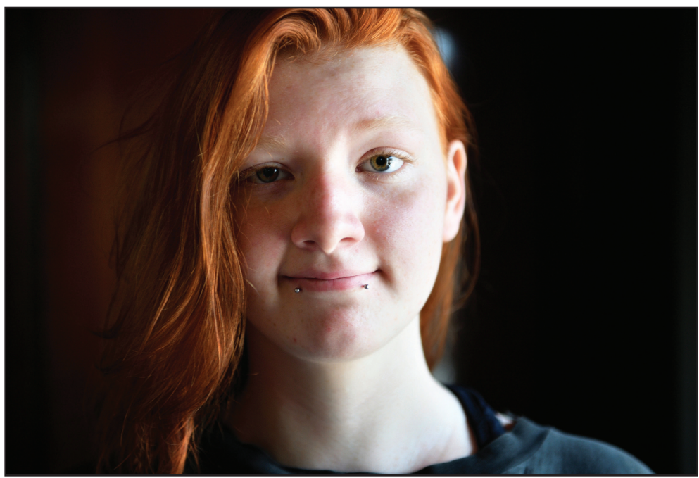
"I've been a vegan seven months and the dairy-free Ben & Jerry's Coffee Carmel is the greatest vegan ice cream out there. It's at Safeway and Wal-Mart but it's expensive. I eat it every occasion that allows it, maybe once or twice a month."