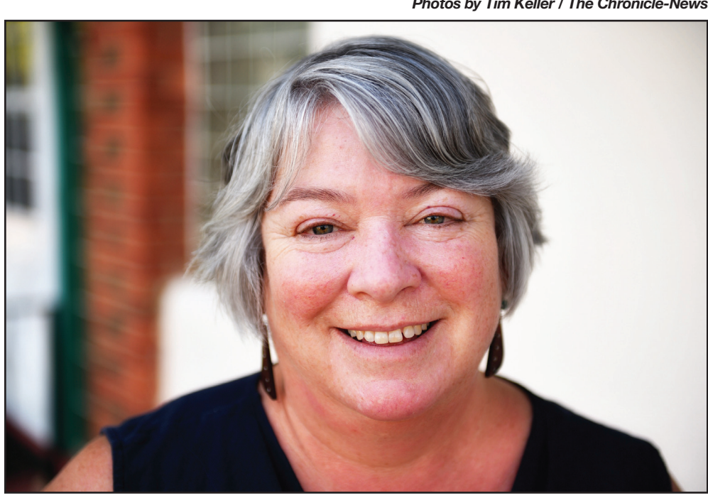
"I started racing sailboats when I was ten. I had a little Sunfish that I raced all around Central Texas and down on the coast. The other kids weighed a lot more than me, which helped keep their boats down in the wind. What was exciting? The competition, and the weather."