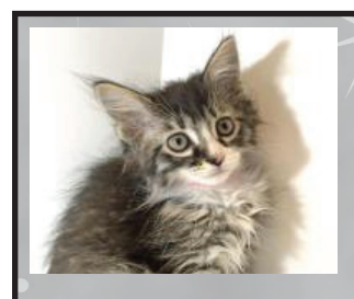
Sax Tabby - black & Domestic Long Hair Mix