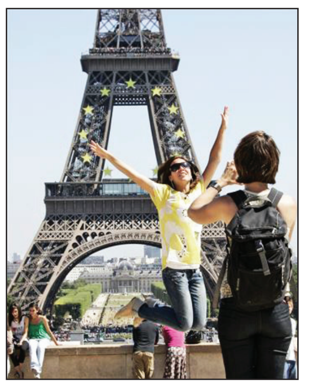
In this July 22, 2008 file photo, tourists take pictures in front of the Eiffel tower, in Paris. A strong U.S. dollar is making world travel cheaper for Americans in 2015.