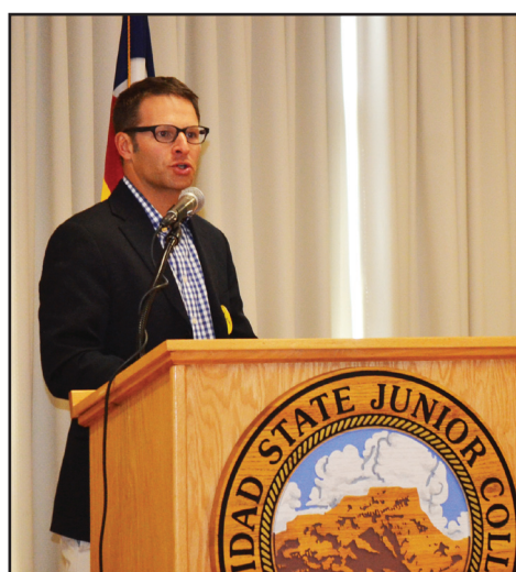
Steve Block / The Chronicle-News

Las Animas County appears to be at the forefront of some of the most recent developments in the field of renewable energy production. The new San Isabel Solar