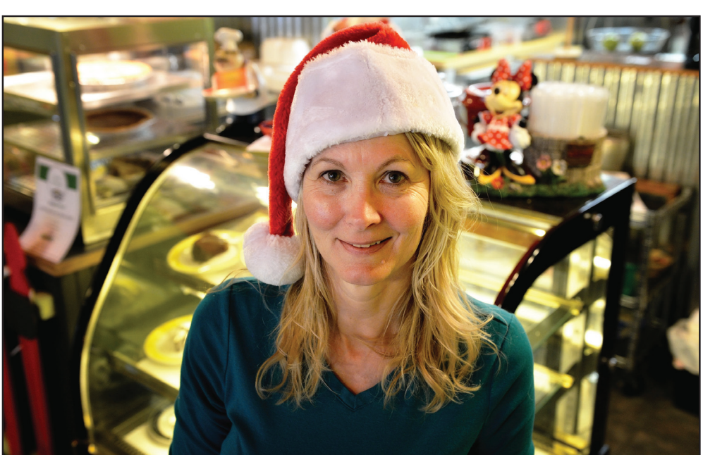
"Is divorce a challenge? Letting go of someone after so many years and deciding to make a new life, a new start without him. You make choices. Sometimes they're right, sometimes they're wrong. You have to live with those."