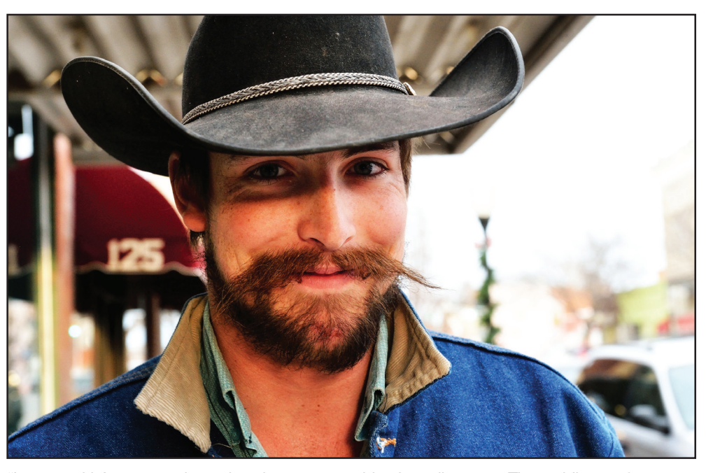
"I was packin' out camp in pocket-deep snow, colder than all get out. The saddle was frozen, an inch of ice. The horse was fresh. He started buckin' on me. It didn't go well for him. I rode him out."