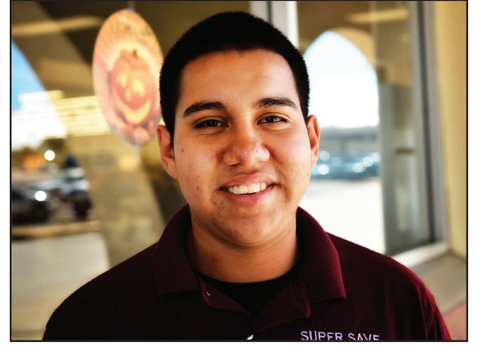
"I'm going to a Mac Miller hip-hop concert in Denver. I might wear a costume—I'm still debating."