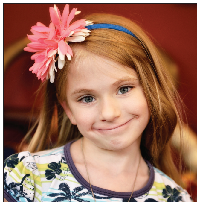
"My favorite season is winter because you get to make snow-mans and you get to sled and have fun."