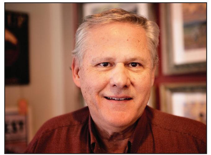
"Fall. We like the cooler weather and changing colors of the leaves. That's why we come up here. We first came 30 years ago. Trinidad is a fascinating and artistic town, and we love the Mitchell Museum."