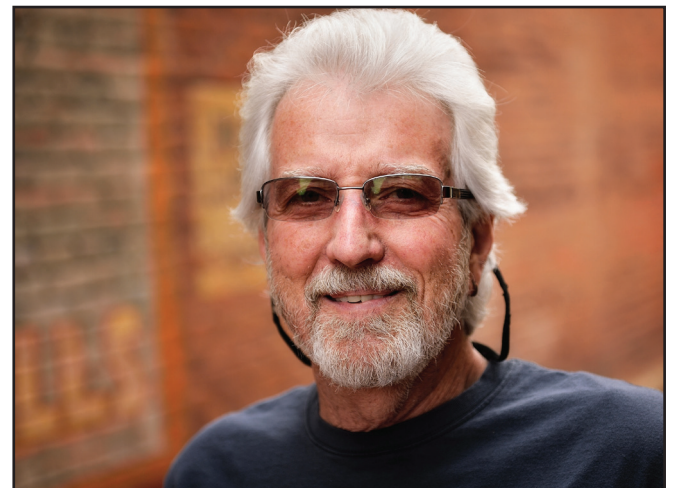
"Summer. You can do a lot more outside activity. I do a lot of yard work, I work on cars outside, and hopefully I'll start riding my 10-speed road bike."