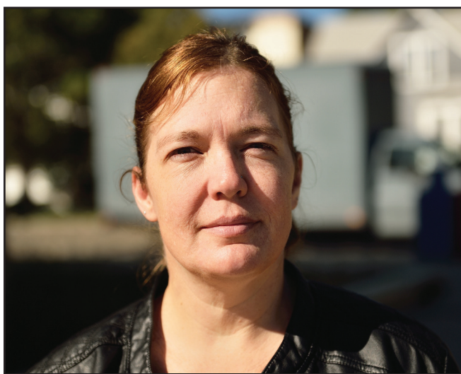
"I have to say spring because it's starting to get warmer and all the pretty flowers are starting to come out. It's nice, getting ready for the summer season when all the fun begins."