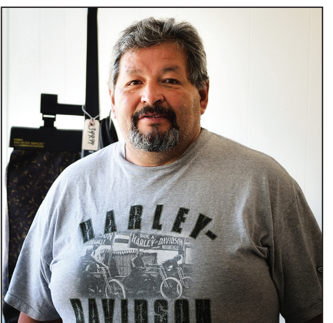
"It's hometown. All my friends and family are here. I come from a family of 12. I was gone for 18 years but I came home and eventually I plan to retire here."