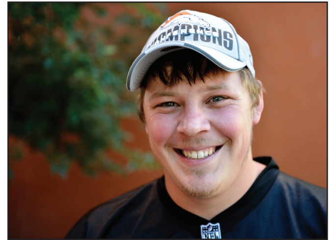
"Logging. That's my exercise, all day, every day. I wear a Fitbit wristband that keeps track, like an account, of the exercise I get every day."