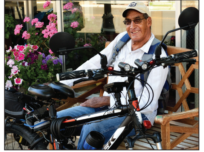
"I ride my bike every day. It's better than the gym. I go pretty far with it—to Starkville, to Cokedale, to Walmart, to the fairgrounds..."