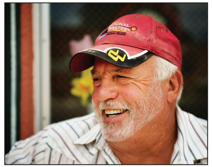
"We drove last month to Wisconsin where I was born and raised. I hadn't been there in about ten years. We visited old friends and went to Lambeau Field—I'm a big Packers fan. We drank Wisconsin beer and ate Wisconsin cheese."