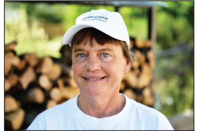
"I'm taking a vacation, back to see my folks and my family in Pennsylvania this month when I can catch the Wayne County Fair. I left there in 1980 and go back to visit once a year, usually for two weeks."