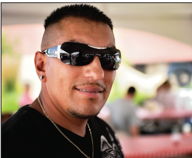
"We're going to Elephant Butte Lake for at least a week of camping and fishing. I'm usually busy at work but I get away a couple times a year for fishing, sometimes at Eagle Nest or Santa Rosa."