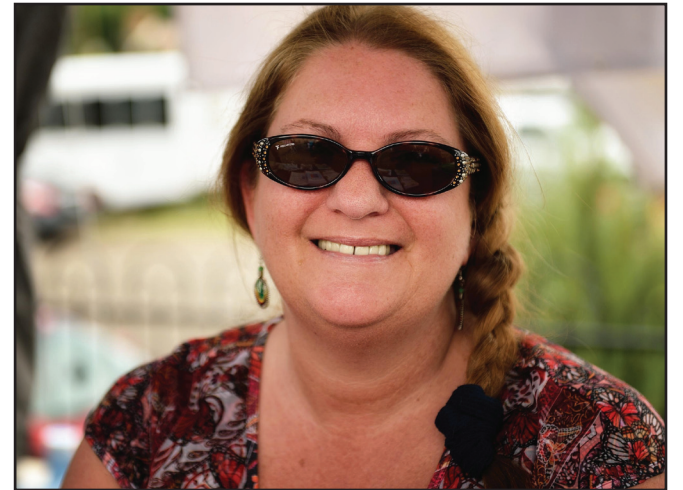
"I like to sleep in. Then I take my three border collies for a run in the Purgatoire River. Then I attend a recovery meeting for myself."