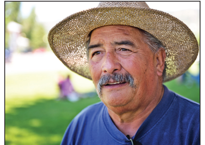
"I watch too much TV, especially a lot of football and baseball. It's too hot to go outside."