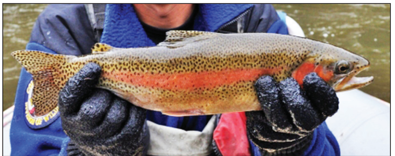
Rainbow Trout

The comeback is positive news for anglers who can once again fish for rainbows and brown trout in Colorado's big rivers and streams. For the past 15 years brown trout have dominated most of the state's rivers. But since last summer, anglers have reported that they are catching nice size rainbows in the upper Colorado, Rio Grande, upper Gunnison, Poudre, East, Taylor, Arkansas and Yampa rivers and others.