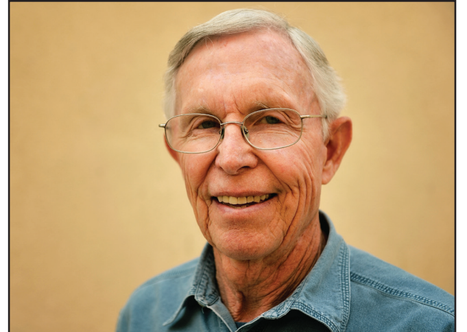
"We live in a very unique place in America, where we know people 90 miles away like they were next door. The landscape is unique and you can see forever. I've been blessed to live here since 1969."