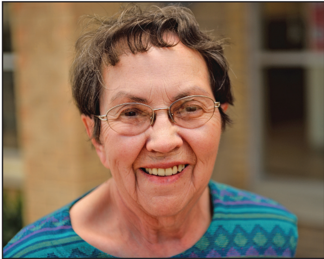
"This is where we went to work when we first moved, in 1952. My husband was from Arkansas, a long-haul trucker. I came from Wagon Mound. We like the small town here in Raton."