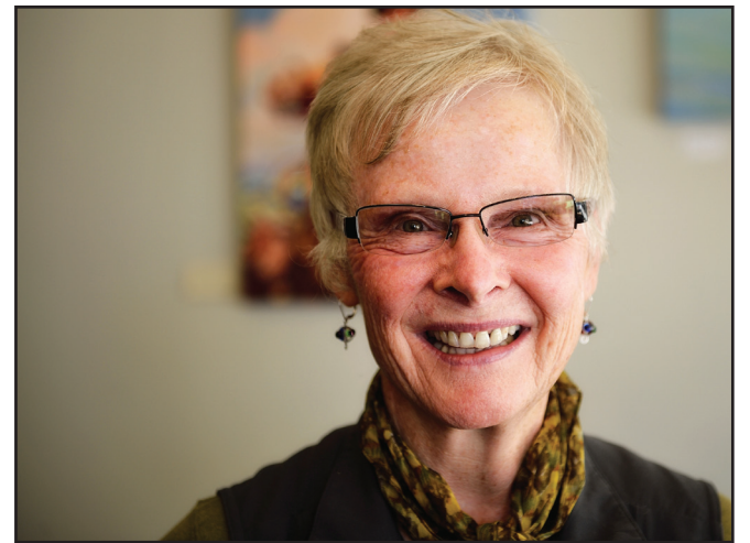
"My husband's co-worker in Washington, D.C., told us about Trinidad so we came to see it in the late 1990s. We were astounded at the beauty of the mountains, the lake, the brick streets, the whole town. We bought property in 2001 and retired here in 2008."