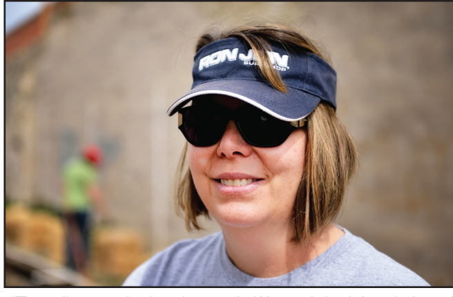
'The yellow crooked neck squash. We use it fresh in salads and we sauté it with a lot of other vegetables-around here it'd be called calabacitas.'