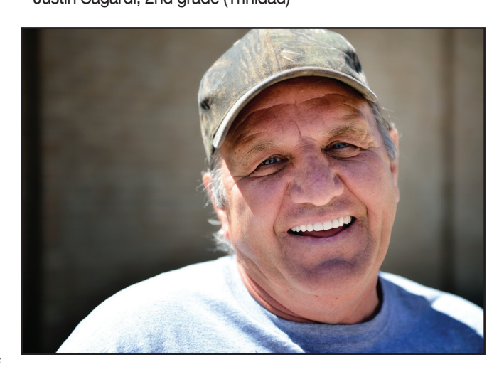
"Dachshunds. Growing up in Raton, we always had dachshunds when we were kids. They're so playful. I had one that loved to