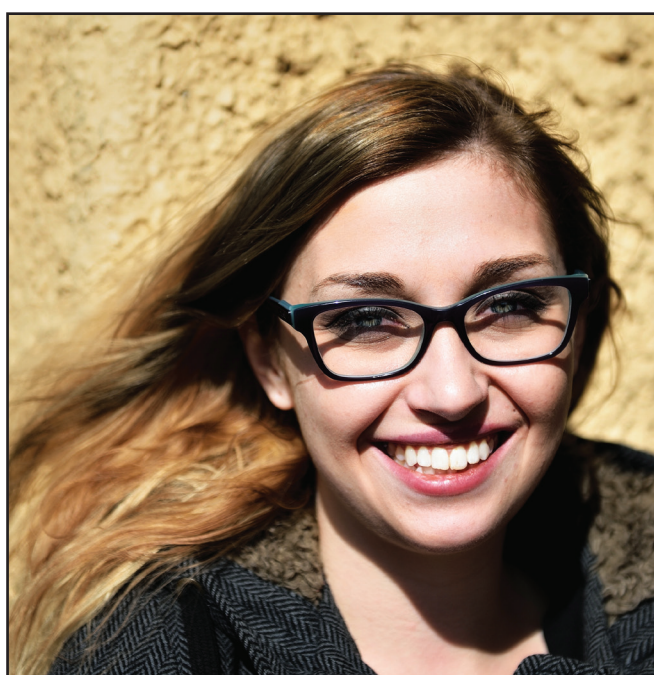
"Counting Texas as my home, the farthest has been Hawaii when I was six or seven. In the last five years, the farthest I've been is here. I'm traveling now just to see everything while I'm still young."