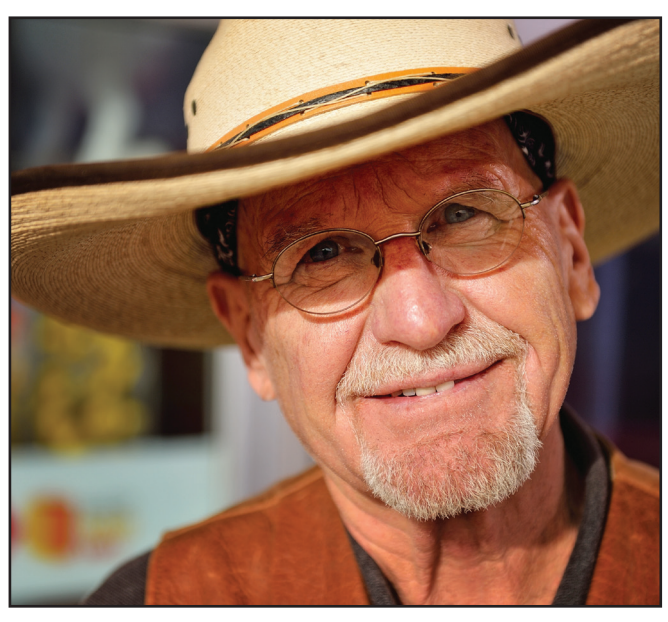
"I read the Taos News, that's it. I don't follow national news: why would I want to listen to a bunch of propaganda and lies? We used to come visit at the courthouse for news. We'd ride a horse up. That was the only place to get news. It was unreliable, but if you didn't come, you didn't get anything."