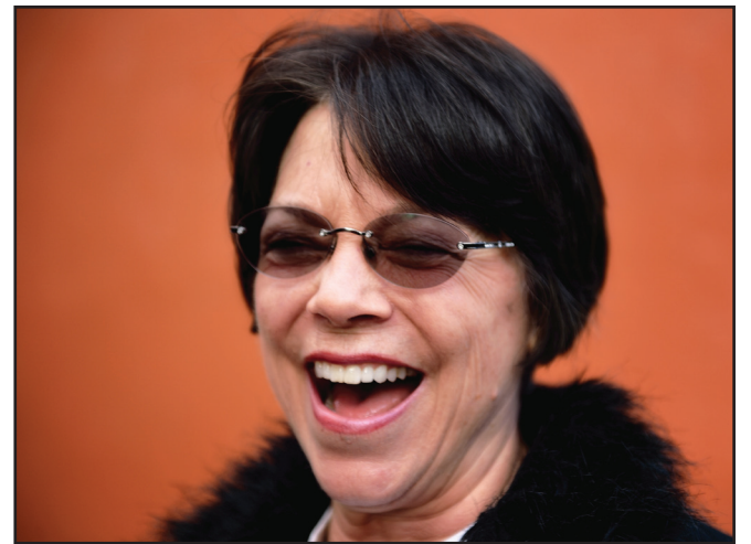
“Satchel-pus Georgina Ramona Gumthumper-drop Davidson! She was a scruffy little black-and-tan mutt that came to our front door. We had a convertible and I always put a scarf around Satch. Like all dogs, she thought she was human, and like all kids, I thought she was human, too.”