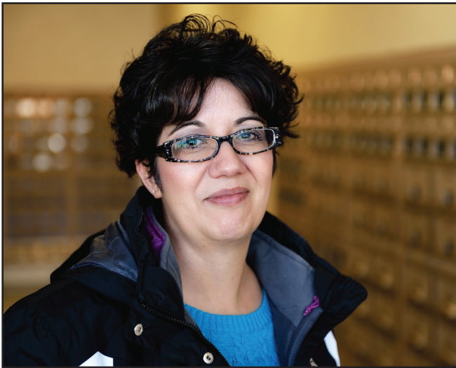
“A cat named Bubba. I remember him being fat, brown and white, and he hung out in a flower pot outside our window sill. I was about 14 or 15.”