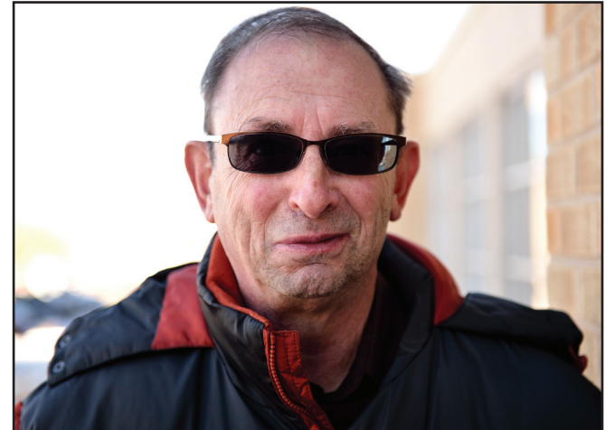
“Buffy, my dog, a dachshund, a weenie dog. He was my favorite dog I ever had. He always waited at the door for me to come home. I was a little boy here in Raton when we got him. We had him about ten years.”