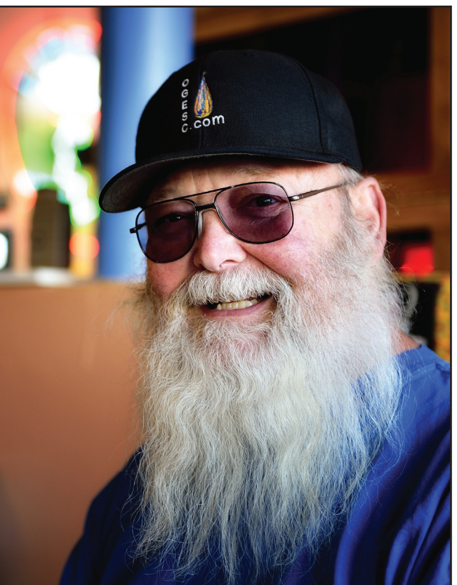
"The Bible. The first book I ever read in its entirety. It helps me live my life. As a person who enjoys proving things, it's given me the most enjoyment."