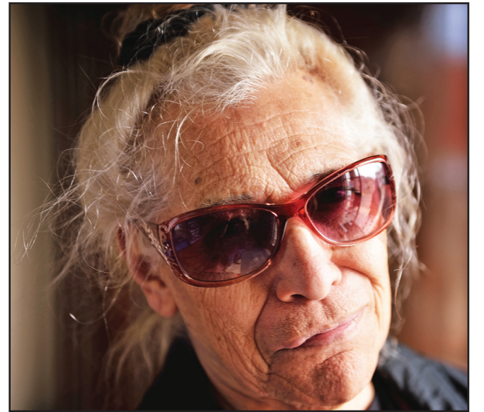
"I left Trinidad for about six years. I went to California to take care of my father's funeral arrangements and ended up working out there in aerospace. My children's illnesses brought me home to