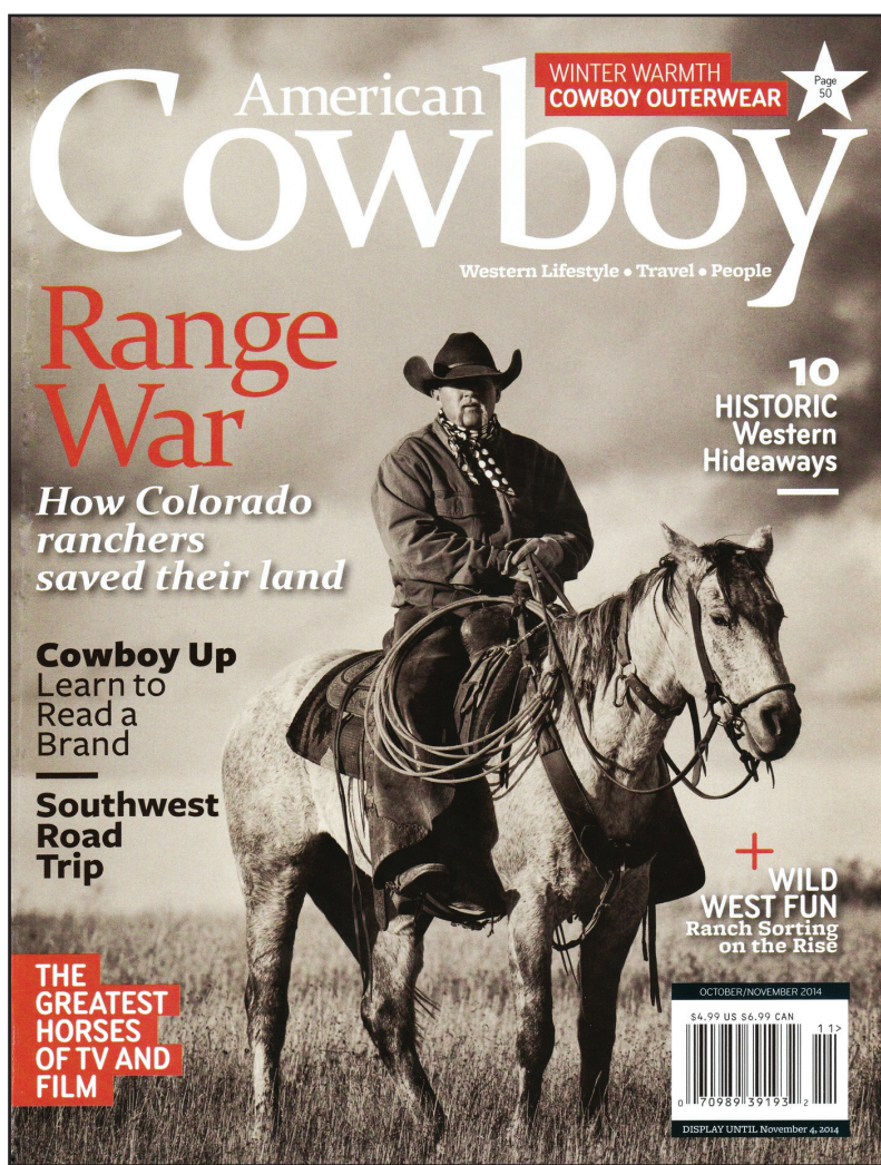
Magazine cover photo courtesy of American Cowboy

By Tim Keller Correspondent The Chronicle-News