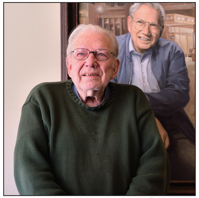
"Find your passion and follow where it leads. Celebrate diversity."