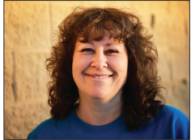
"A pleasant surprise would be to learn that I've won an online writing contest that I entered. I sent a personal essay called 'Portrait of a Hoarder'."