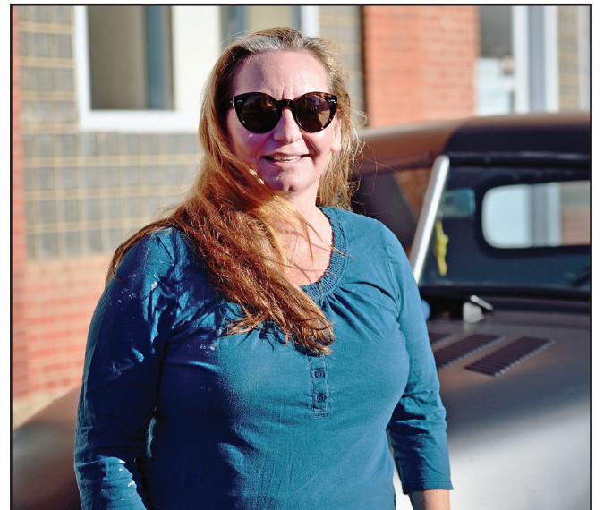
"Morrissey's 'How Soon Is Now.' I actually sing in the tub, every day. There's really good acoustics because it's tile and the ceiling is high. If I empty the tub even one third, the acoustics are