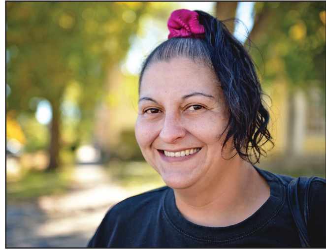
"'Angel Baby.' I don't listen to too much music. I'll sing aloud when I'm drinking but not in the shower. I like Spanish music when I'm drinking, but I can't remember none of the songs."