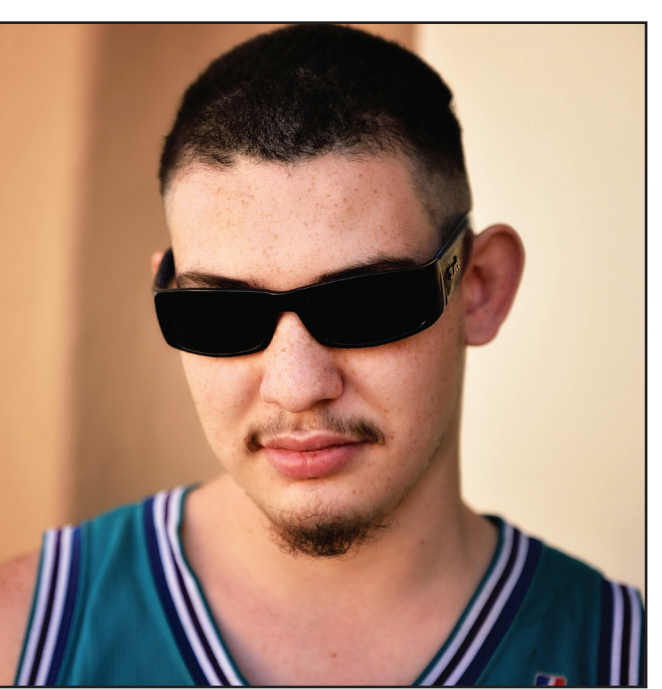
"'Back in Black' by AC/DC. 'I'm back, yes I'm back in black.' I sing it every time I take a shower. Usually I sing along with whatever I have playing on my iPod.