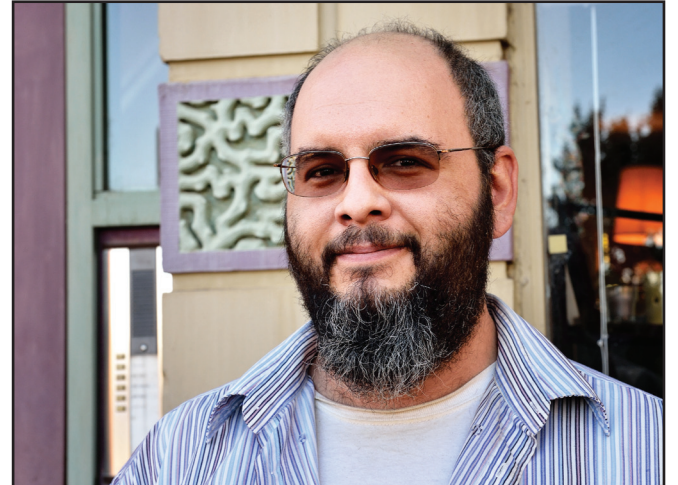
My mom's family brought me here from Southern California a couple of years ago. It was for convenience. I can live inexpensively here and it's a nice place to live until something else comes along."