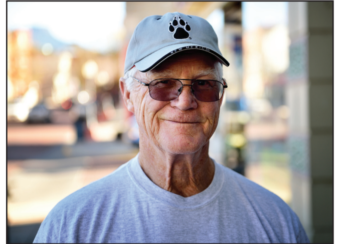
"We stay over in Trinidad because it's a great town. We're on our way to a football game in Boulder, CU vs. UCLA. A guy I played with at UNM, his son plays for Colorado."