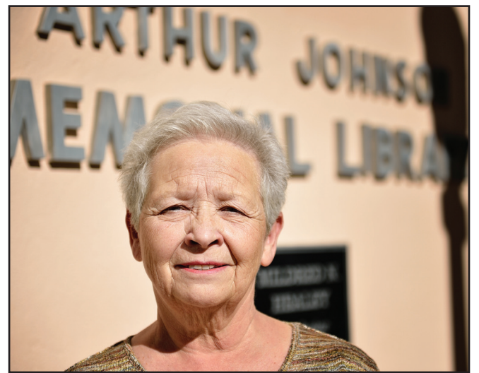
"We moved here 16 years ago for the weather and the NRA Whittington Center. We came from Minneapolis, so you know what the weather means to us."