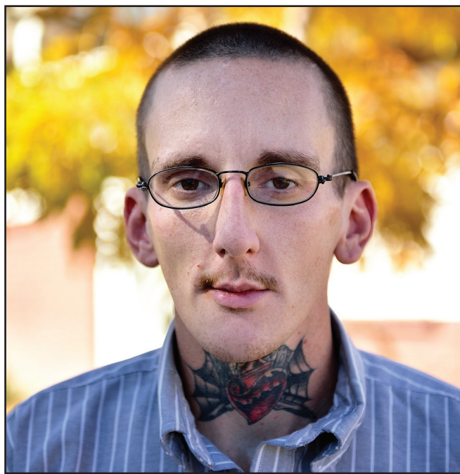
"I came from Albuquerque to visit my grandmother. I didn't think I'd stay this long. It was just supposed to be a visit. That was 2009."