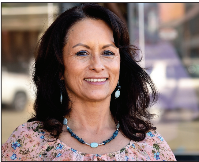
"I was born here, in 1962. I left in 1980. Had to find out what was better out there. I came back from Denver 25 years later, tired of corporate America. I didn't appreciate Raton until I moved back."