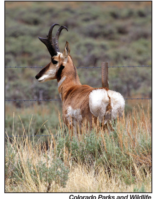
Colorado Parks and Wildlife

Individuals who kill big game animals in Colorado and abandon the carcass can face felony charges. If convicted, individuals may permanently lose hunting and fish-