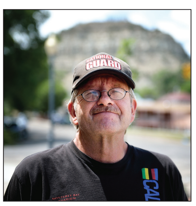
"The economy. There's not enough businesses and not enough jobs. Too many people are leaving town, like small towns all across the country.