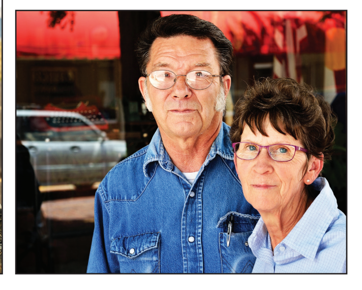
"We'll be spending it home by ourselves, probably doing yard work.'