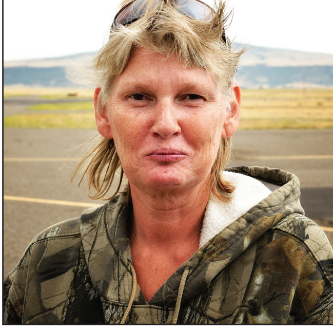
"My sister-in-law's coming from California. I've never met her. We'll picnic at the house, and then go watch the fireworks show along First Street.