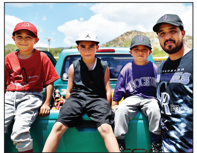
"When I'm coaching the kids. My boys are in T-ball and minor league. I enjoy giving back to the community."