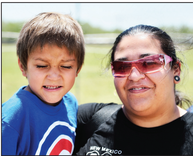
"When I'm with my son. We do a lot of playing. He amazes me every day by some of the stuff he says and does. Today he was awesome in T-ball!"