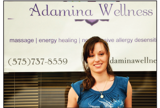
"When I'm out hiking. It's the peace and stillness that's in nature. Breathing the dirt and the air relaxes me. Sunshine is rejuvenating and energizing."