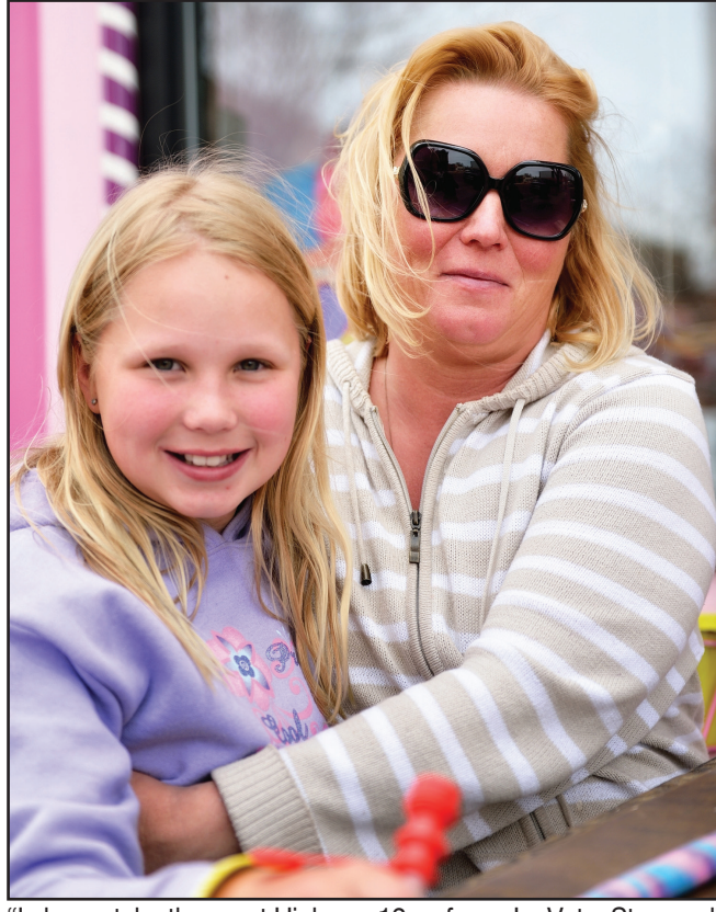
"I always take them out Highway 12 as far as La Veta. Stonewall is so special. At Cuchara you can play mini-golf or take your dog on the terrace at The Dog Bar."