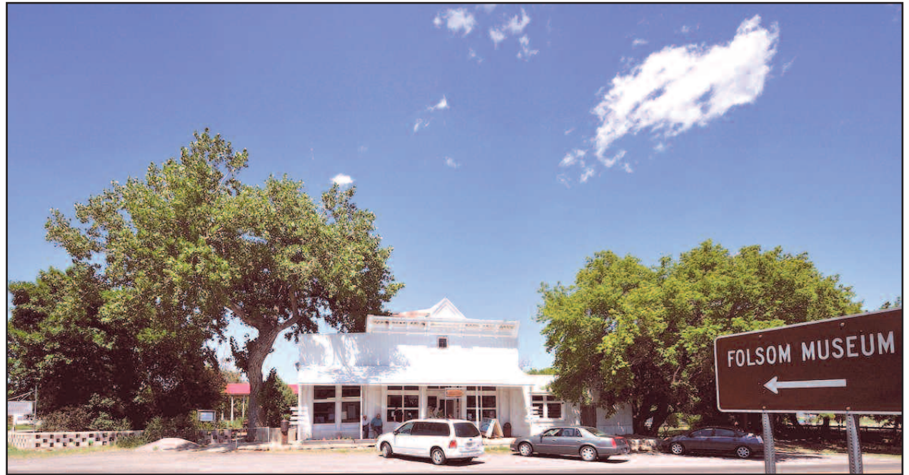
The Folsom Museum hosts its annual western night under the stars, complete with chili cook-off, Saturday evening.