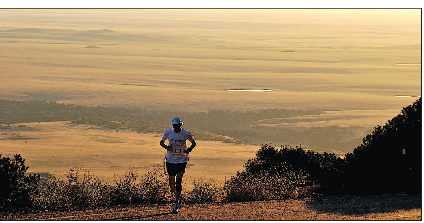
A runner methodically paces himself up Capulin Volcano at sunrise during last year's inaugural Capulin Volcano half-marathon.

In addition to its mutual aide agree-Continued on page 2