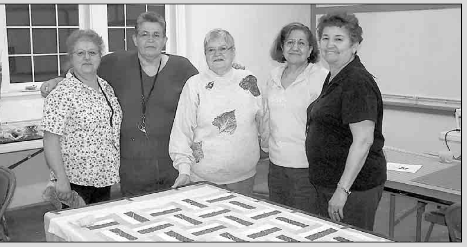
The beginner's quilting class at Luna Community College work together to make a baby quilt. Some of the students will begin making guilt blocks to donate to the Marine Comfort Quilts, which provides guilts to the families of fallen American soldiers.