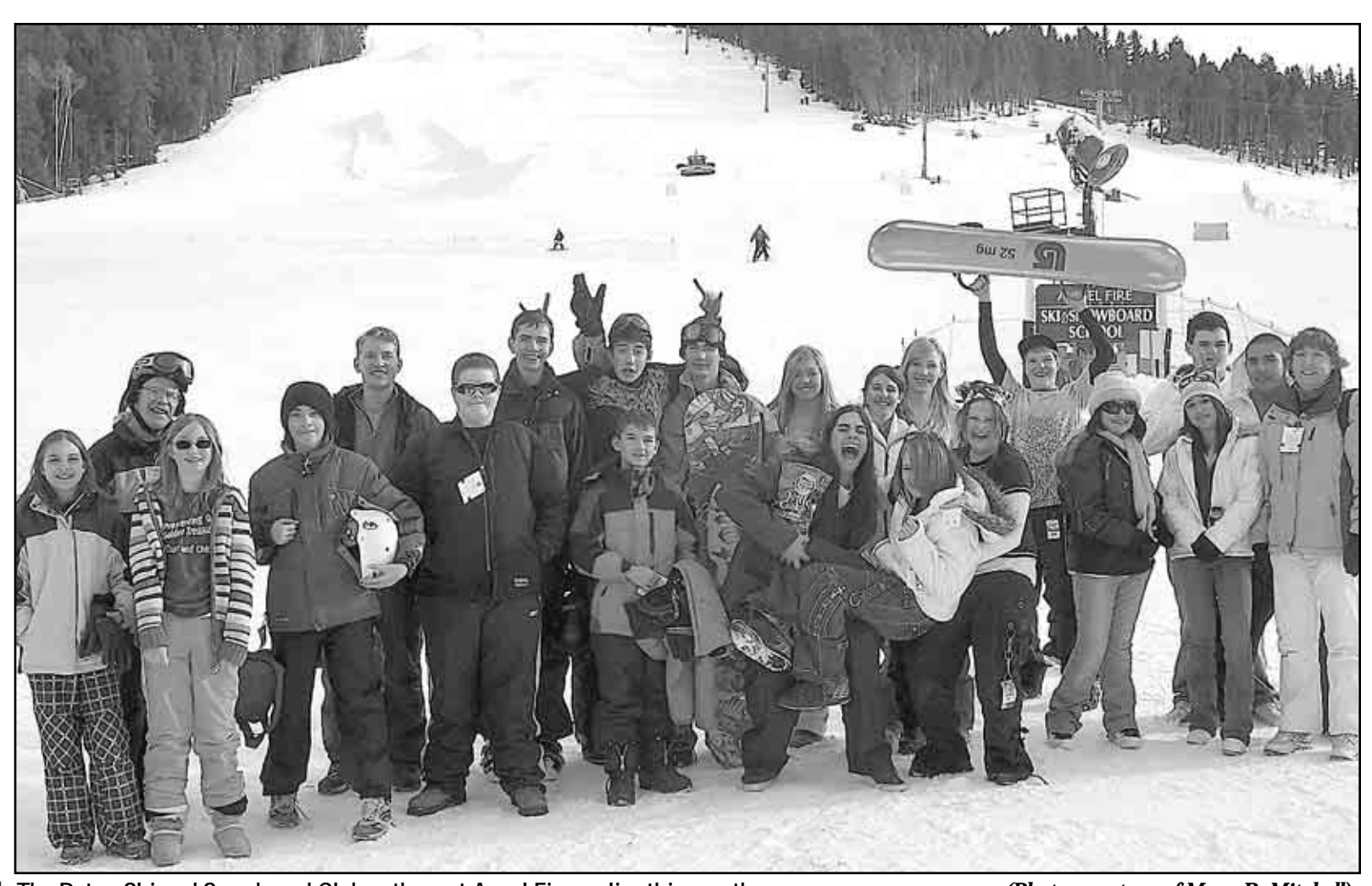
The Raton Ski and Snowboard Club gathers at Angel Fire earlier this month.

The charges contained in the indictment are allegations, and the defendant is presumed innocent unless and until proven guilty.