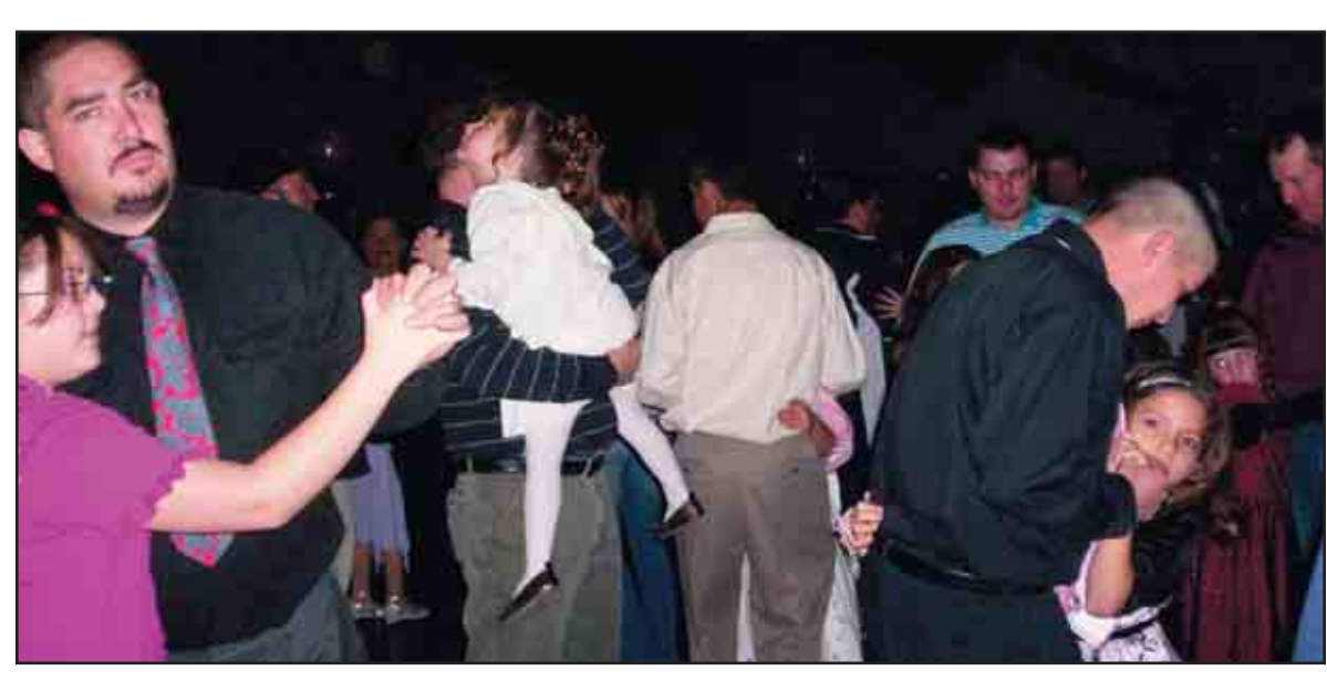
Several fathers step out on the dance floor for an easy, slow dance with daughters.