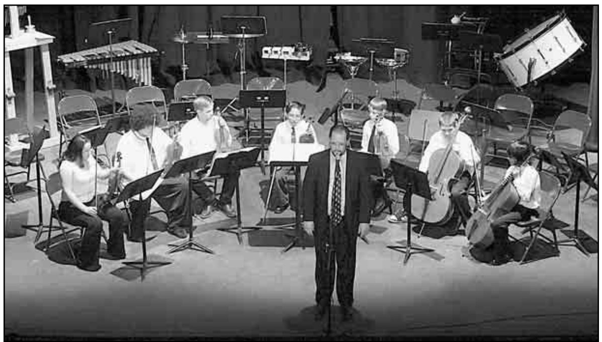
Raton Middle School Beginning Orchestra