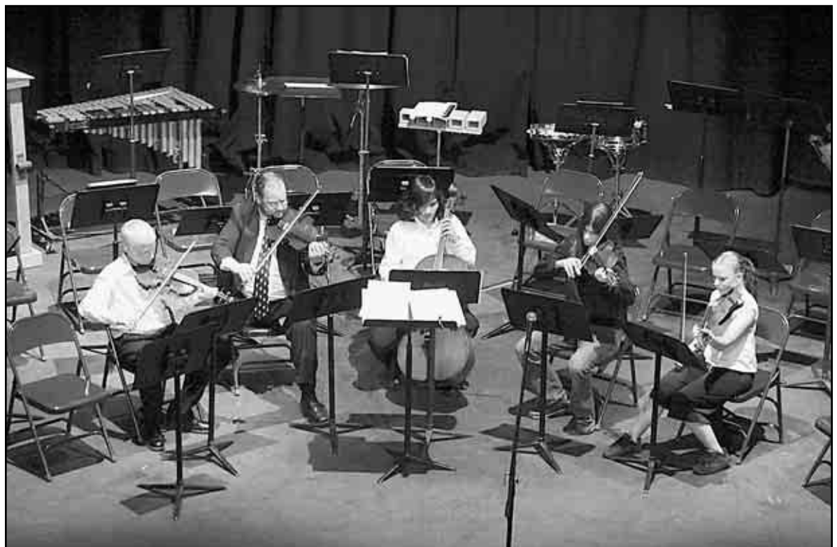
Raton Middle School Tiger Orchestra