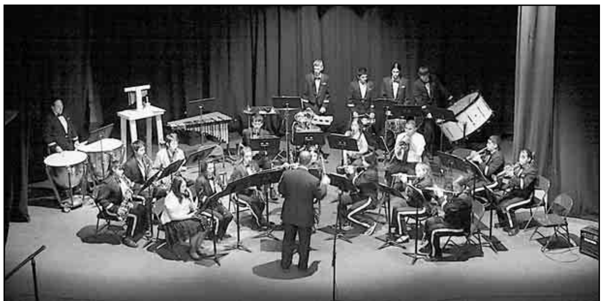
Raton High School Band